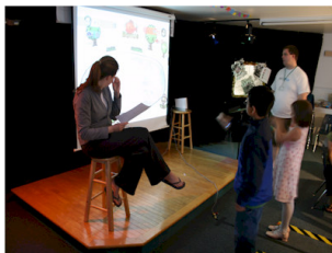
Wii are Fisher's of Men