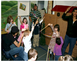
Noah's Ark & Interactive Fun