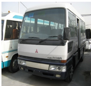
Malawi Bound Buses Roll In