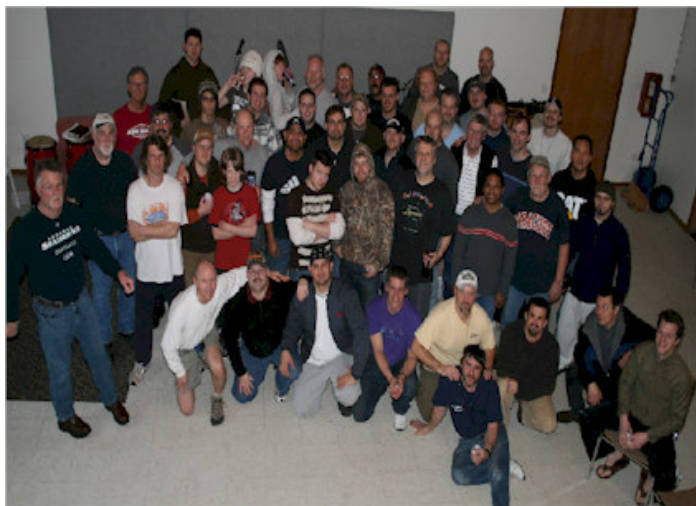
(February Men's Retreat Was Amazing! Continued from page 2)

It was more than men just nodding their heads towards each other and saying, "Dude".