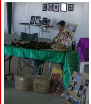
Malawi Fair 2008

"Why are all of these beautiful, desperately poor people waving back at me?"