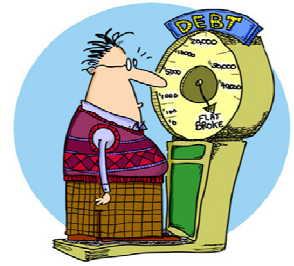
TOO MUCH MONTHS AT THE END OF THE PAYCHECK?