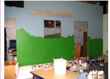
New Preschool Wall Mural Created by Lana Dowell