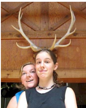
Youth spend a week during the Pause @ Camp Epoch